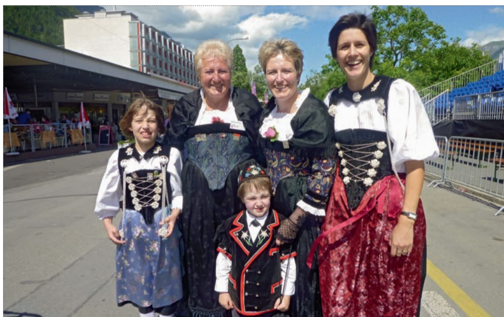
Swiss national Jödler Festival in Interlaken