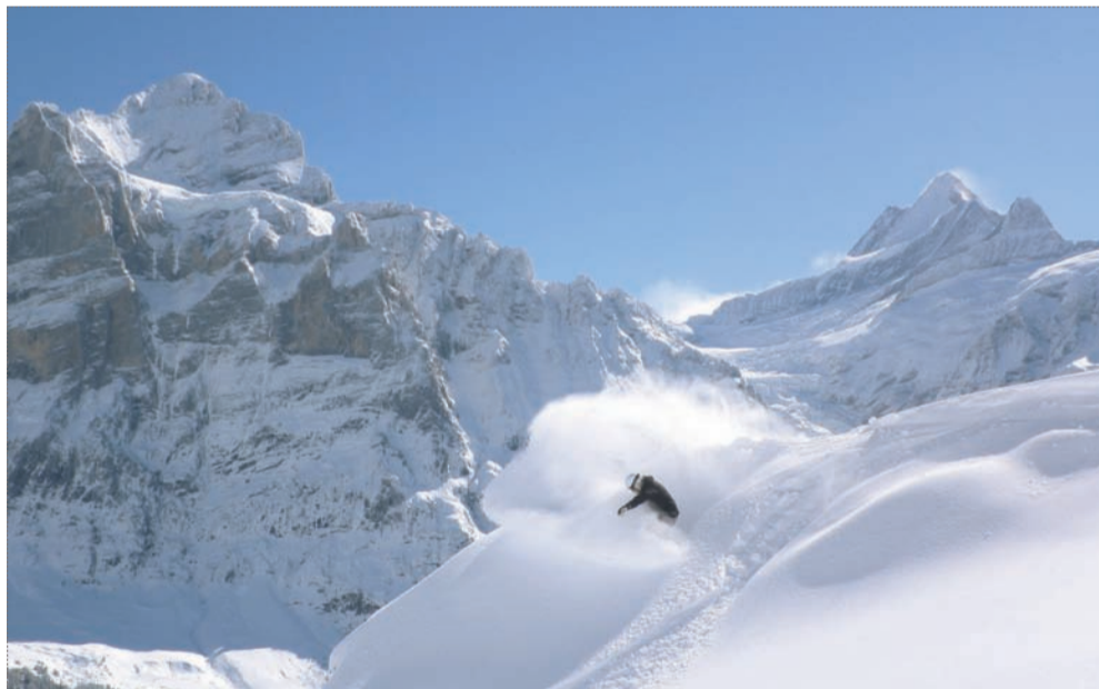
Unbelievable but true! Virgin snow on the 9 th of October 2011